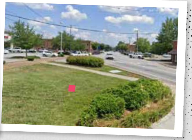
*Near 200 North Green Street.