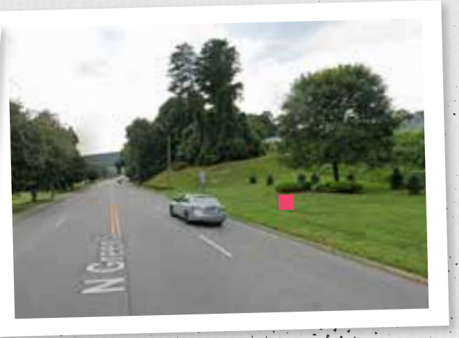
*Near 520 North Green Street.