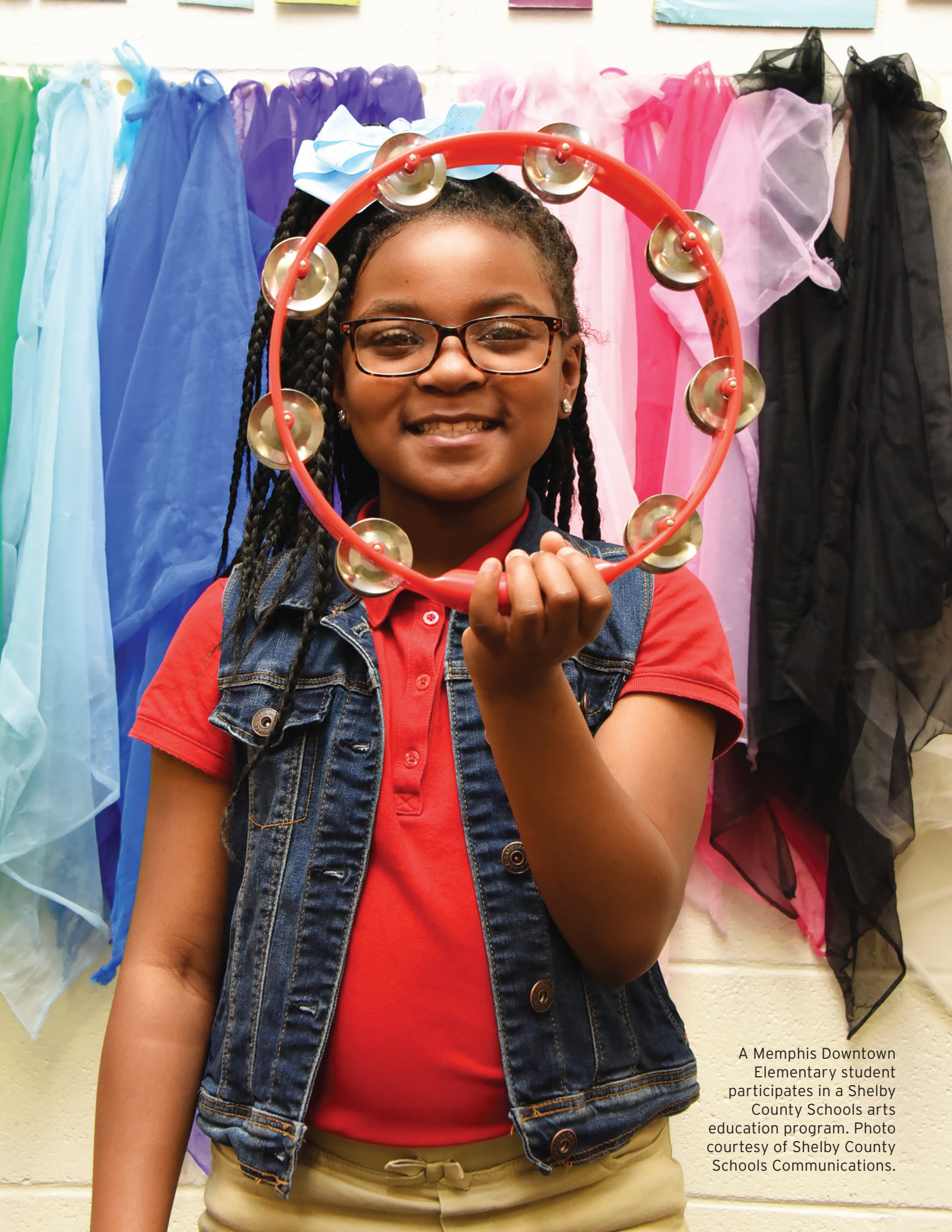
A Memphis Downtown Elementary student participates in a Shelby County Schools arts education program.