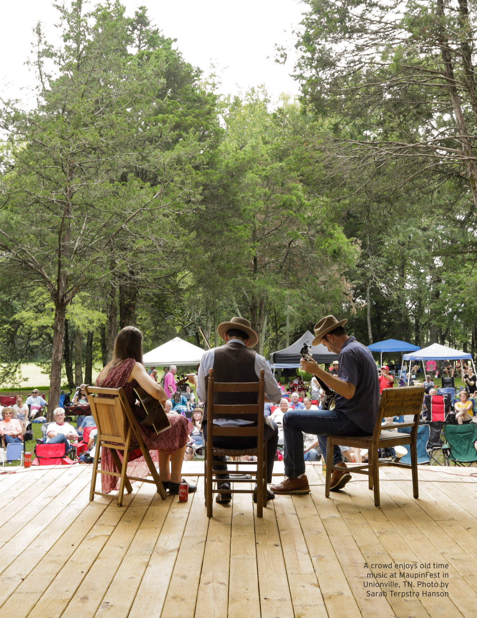
A crowd enjoys old time music at MaupinFest in Unionville, TN.