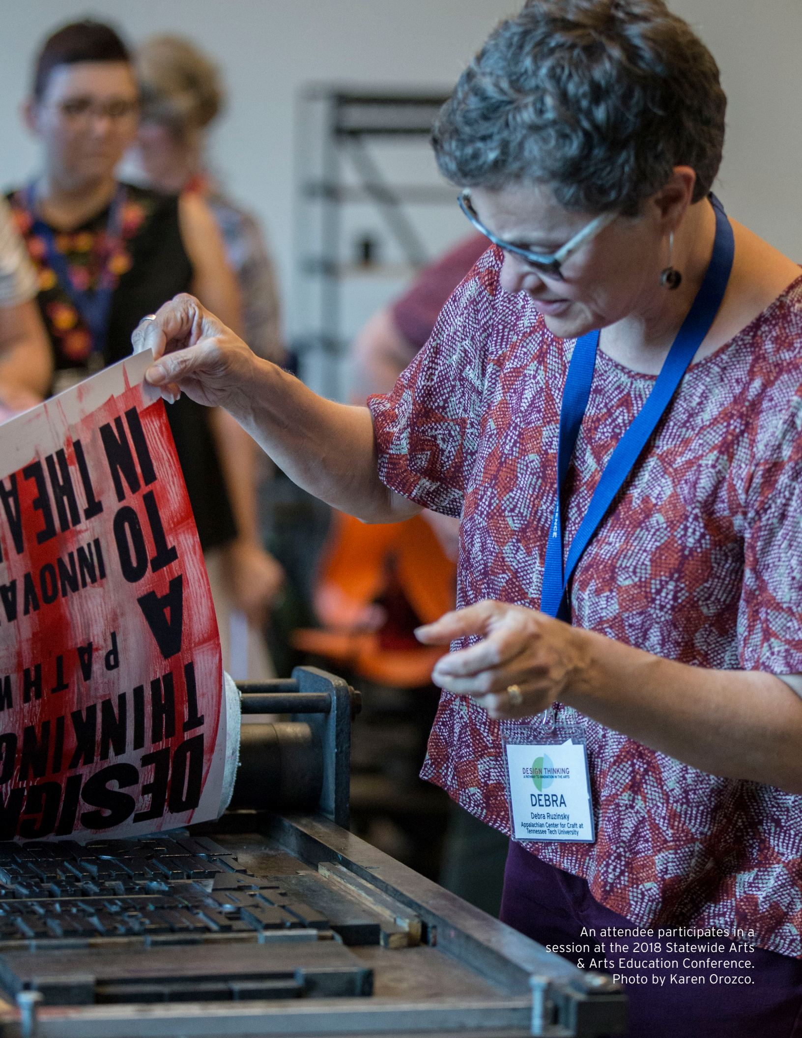
An attendee participates in a session at the 2018 Statewide Arts & Arts Education Conference.